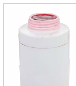
G83F-HP For use with F type threaded grease cartridges